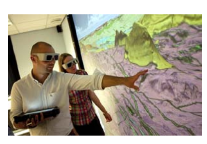
Back to contents

Source: ABC Radio National Background Briefing programme "Mismanaging Disasters" (27 February, 2011)