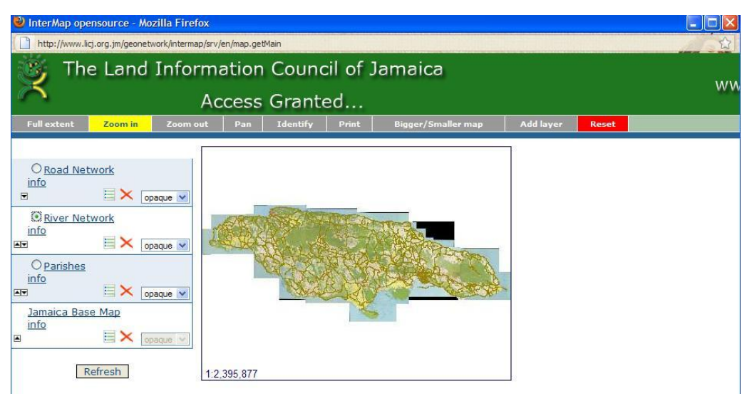
Screen shot of the national geospatial data clearing house/portal

Central to the development of Jamaica's National Spatial Data Infrastructure (NSDI) was the establishment of metadata and geospatial portals built on opensource software Geo-network. The portals allow for search, retrieval, updates and management of metadata records and the discovery and viewing of selected spatial data sets. These services are provided via the LICJ website at <a href="http://www.licj.org.jm/geonetwork">http://www.licj.org.jm/geonetwork</a>