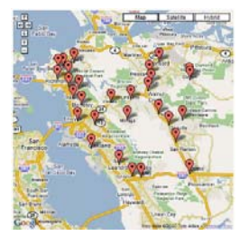
Vol. 7, No.01

The Semantic Web envisages software agents that know how to reason over activities, events, locations, people, companies, and their inter-relationships. Learning more about customers through behavioral and Activity Recognition is here today through currently available Semantic Technologies and is a showcase for how these technologies will evolve. This article describes real world examples of Activity Recognition using a combination of